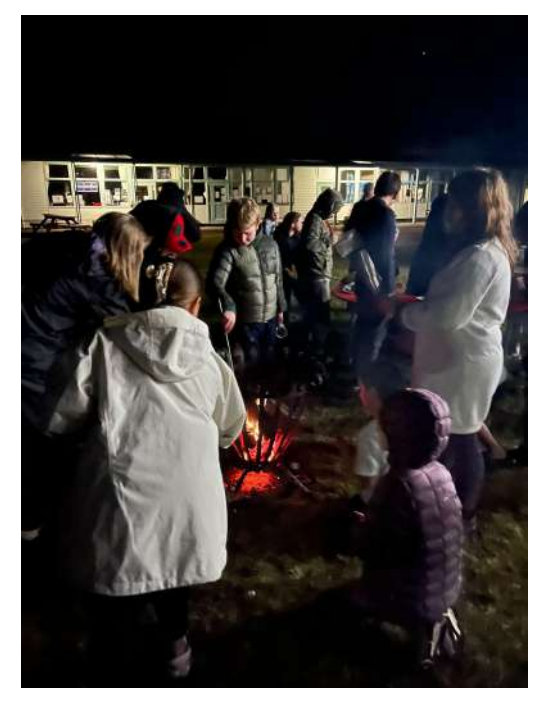
Middle School Puanga Celebrations

We wish to thank everyone who has supported our school this term whether it be transporting to multiple events, coaching or being part of our sideline cheering teams at sport events. We also thank those people who have supported our learners in other ways such as within the classroom in learning spaces. Schools are busy places and we simply cannot get our kids' activities supported unless we have YOU so thank you!. As we head into term 3 we will have many activities to look forward to including snowsports, speech night, Inter-school Dance Competition and Cross Country- if you are able to support us, please let us know!