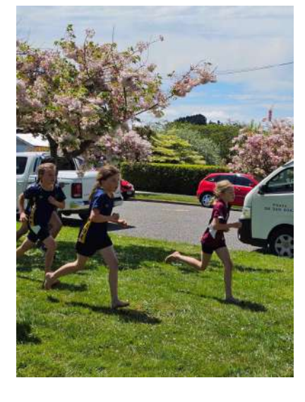
Value of the week Integrity

When we stay focused, do great work, act kindly towards others, all when no one is watching, we are showing integrity