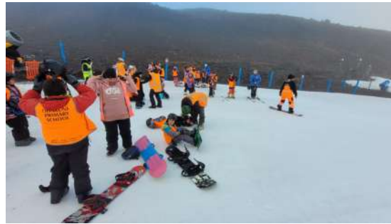
Education Outside the Classroom Classroom Snowsports